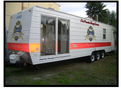
FEMA Fire Prevention & Safety Grant Fire Safety House $47,281